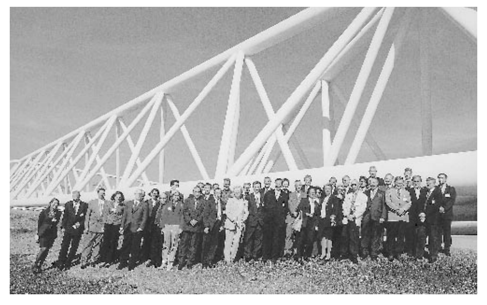
First meeting of the EUROSAI-IT Working Group.