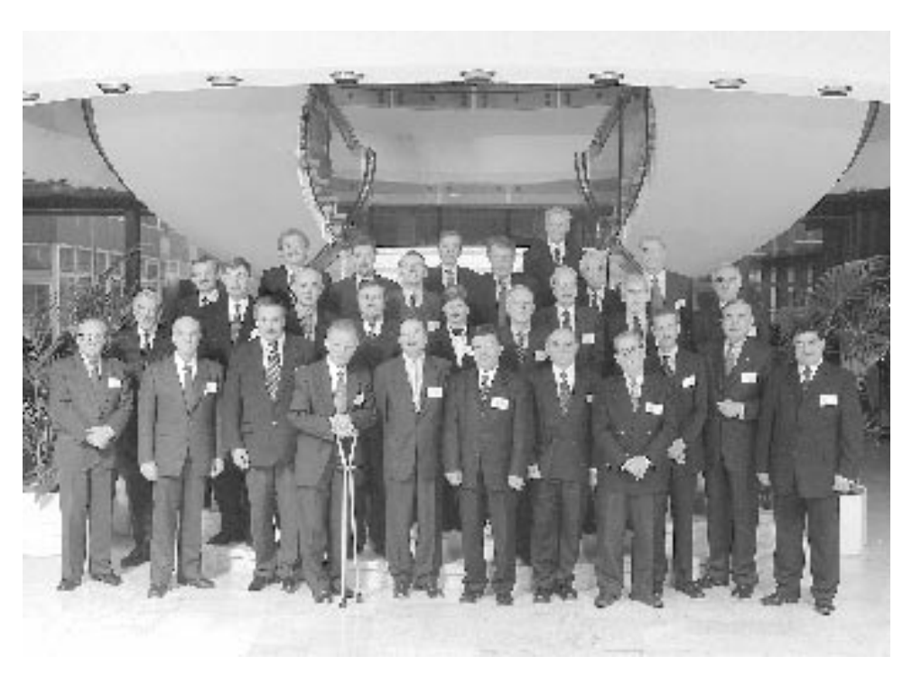
Presidents of the SAIs of the EU and the Candidate Countries in Luxembourg in 2002.