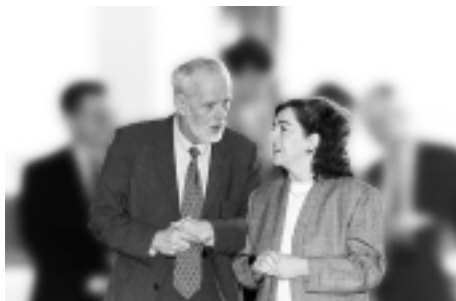
Mr. Jan O. Karlsson, President of the ECA and Mrs. Michaela Schreyer, European Commissioner responsible for Budget.

the Council. In view of the objective, shared by both Commission and the Court of Auditors, of optimising the protection of the financial interest of the European Community, the European Commission needs to strive, through fundamental reform of the Financial Regulation, for more efficient ("best practice") financial management, speedier payment systems, greater accountability and all in all, better value for money. Please see the Opinion 4/97 of the ECA on the matter for further details.