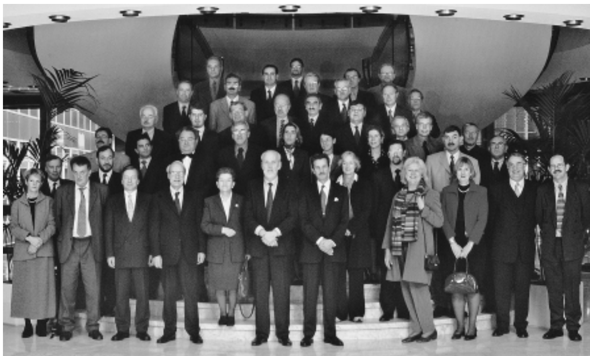
Group Photo of the Meeting of the Contact Committee of the Supreme Audit Institutions of the European Union, Luxembourg 21 November 2000.