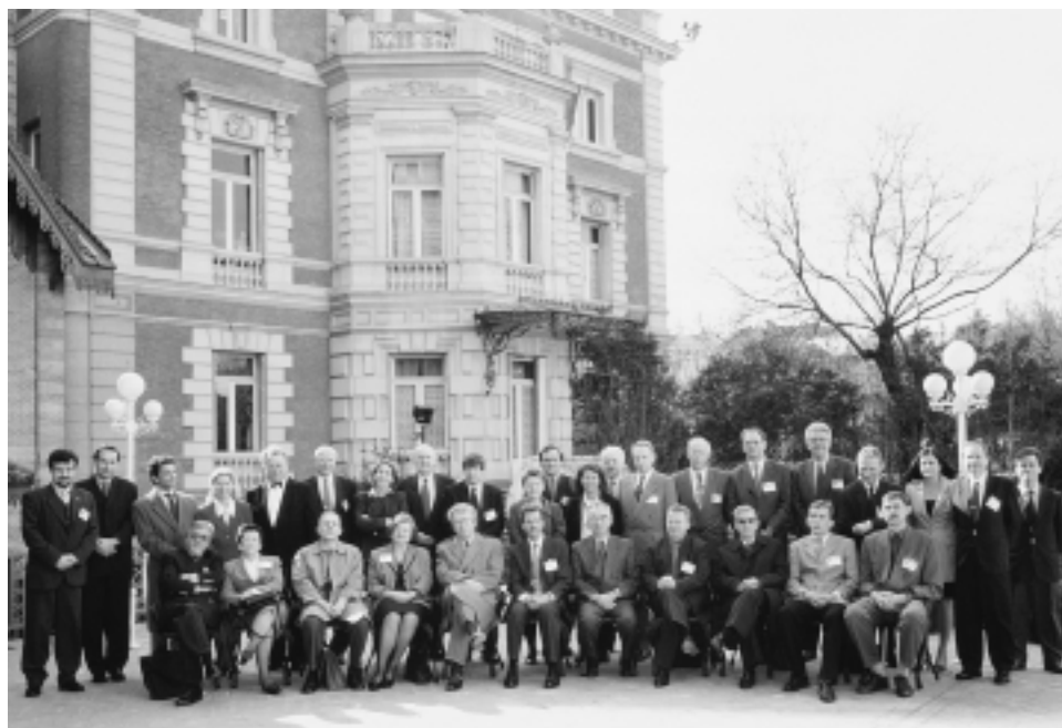
22 nd Governing Board of EUROSAI.

been assigned to the Training Committee. This subgroup, made up of the SAIs of Norway, the future Secretariat if the IDI, Spain, France, Poland and the Czech Republic, has been making progress in this cooperation and has been preparing the bases for a Long-term Regional Training Programme (LTRTP) for EUROSAI. This is a wide-ranging programme whose content will have to be decided by EUROSAI. The search for funds to finance the programme is now underway.