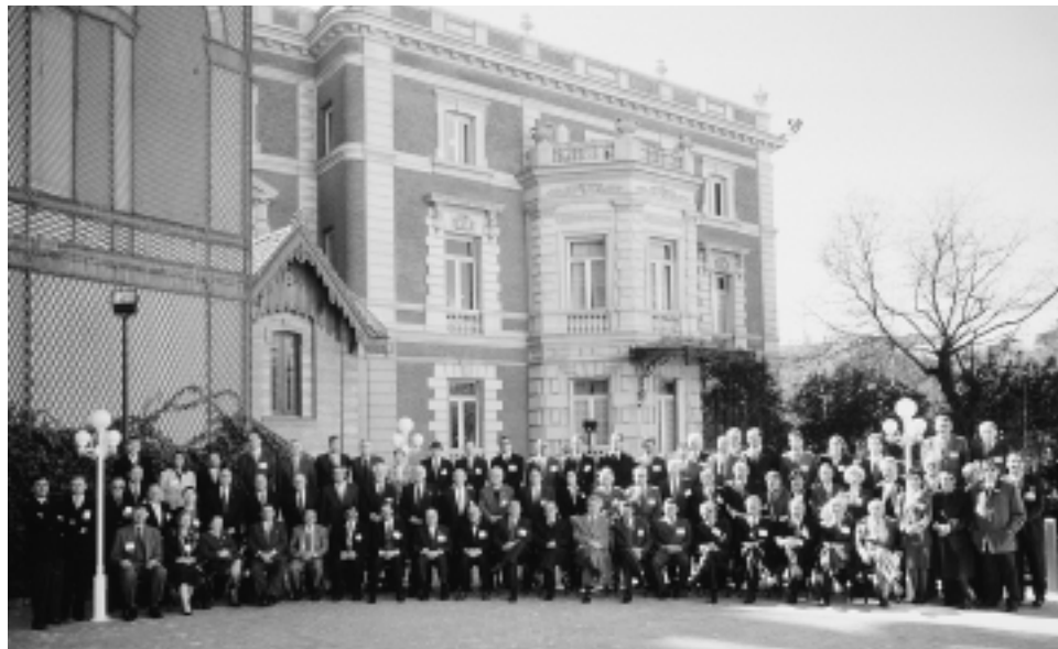
First Euro-American Conference. Madrid, 2000.

closed systems towards open systems, the different processes of regional rapprochement in Latin America—such as those of MERCOSUR, the Andean Community and the Central American Integration System—have generated new spheres of action for the SAIs of Europe and America and have given a new dimension to their cooperation.