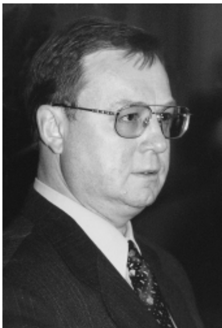
Mr. Sergey Vadimovich Stepashin, new Chairman of the Chamber of Accounts of the Russian Federation.

After being elected to the State Duma of the Federal Assembly of the Russian Federation in December 1999 he became Chairman of the State Duma Commission on the Fight against Corruption.