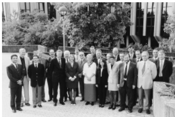
Meeting of the Liaison Officers of the European Member States in Luxembourg on 3-4 October 2000.

nancial Regulations and the state of play of the implementation phase of a digital network between SAIs of the EU Member States and the ECA under the TESTA Community programme.