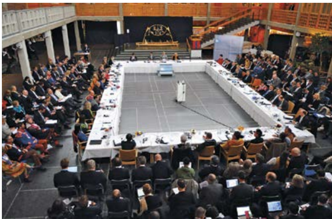
The foreign ministers meet every other year at the Arctic Council's Ministerial Meeting. The most recent meeting was in Kiruna in 2013.

The audit shows that the Arctic Council does not have a strategy for steering the technical and financial resources towards long-term goals. The working groups' two-year work plans are approved at the Ministerial Meetings after discussion by the SAOs. The premise of the work is largely determined by the working groups themselves. Such independence can be positive, but in the opinion of the OAG, it must be assessed at the same time against the scientific gain and the huge financial resources spent in the Arctic Council. At mid-2014, between 80 and 90 projects are in progress under the auspices of the Arctic Council, and the overall assessments behind the initiation of so many projects are often unclear. Even though small projects may also be important in building knowledge and collaboration in research and management, and only a few of