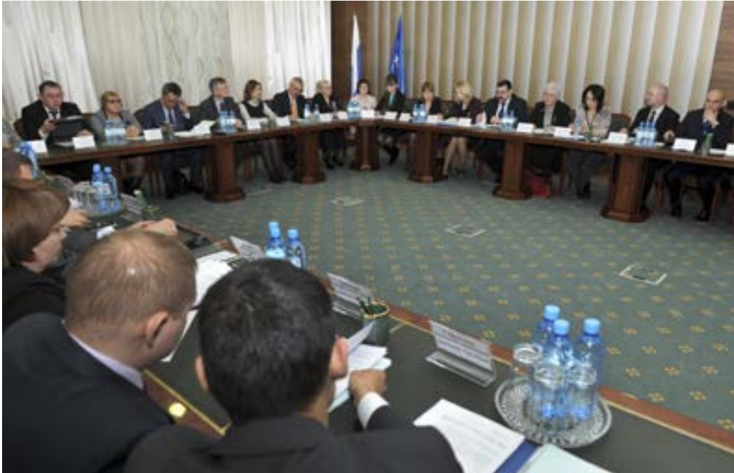
Joint interview with representatives of the Yamal-Nenets autonomous district in Russia on Arctic issues.

the United States and the Sami Council (a Permanent Participant group) support the mechanism. However, the implementation of this instrument requires financial contributions from all parties to the PSI. The implementation process is completed and the PSI is operational as of December 2014.