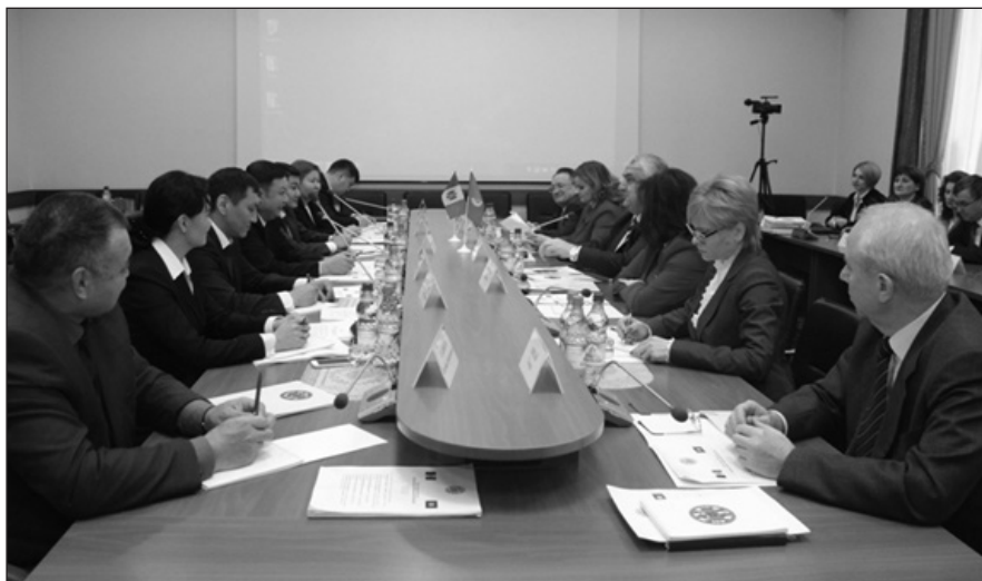
The Kyrgyz delegation (left) and the CoA's Management (right) meet in January 2014 to discuss issues related to the exchange of experience.

cooperation with other stakeholders (such as Parliament, civil society, and the media) and the new INTOSAI audit standards such as ISSAI 12. The workshop was divided into sessions featuring interactive discussions between participants. Every topic discussed was combined with practical examples and exercises based on case studies, followed by discussions, presentations, debates, and the sharing of experiences.