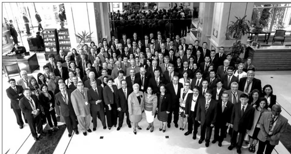
Participants gather at the 23rd OLACEFS Assembly in Chile in December 2013.

The Organization of Latin American and Caribbean Supreme Audit Entities (OLACEFS) held its 23rd General Assembly in Santiago, Chile, December 8–11, 2013. Hosted by the Office of the Comptroller General of the Republic of Chile, the assembly drew delegates from Argentina, Bolivia, Brazil, Colombia, Costa Rica, Cuba, the Dominican Republic, Ecuador, El Salvador, Guatemala, Honduras, México, Nicaragua, Panamá, Paraguay, Perú, Puerto Rico, and Uruguay. Other participants included representatives from INTOSAI Secretariat (Austria), INTOSAI Governing Board Chair (China), INTOSAI Development Initiative (Venezuela), INTOSAI's Capacity Building Committee (South Africa), AFROSAI (Cameroon), the Cayman Islands, Chinese Taipei, European Union, France, Germany, InterAmerican Development Bank, the Organization of Economic Cooperation and Development (OECD), Portugal, Spain, Suriname, and the United Nations Office on Drugs and Crime.