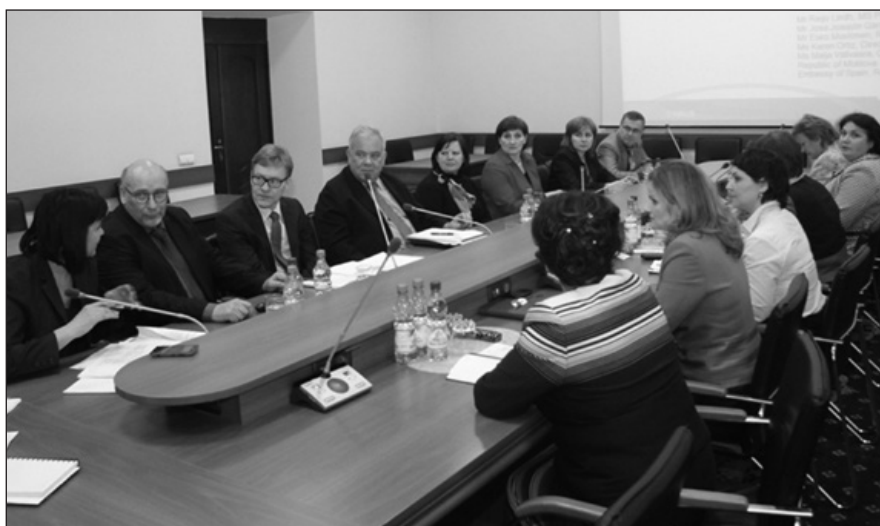
The Consortium of Twinning Partners and the CoA's Twinning Working Group hold a workshop in January, 2014.

During this time, the CoA's auditors also attended the workshop "Strengthening Institutional Capacities of SAI," organized by the Center of Excellence in Finance in Ljubljana, Slovenia. The workshop focused on various topics, such as the SAI's role in rising accountability in the public finance system, the perception of the role and responsibilities of SAIs in