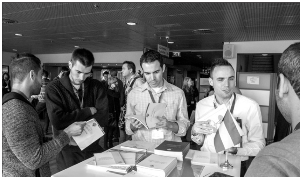
Young auditors identify challenges and opportunities for European Supreme Audit Institutions.

The YES Congress first identified strategic and operational challenges facing SAIs. The participants then had to think up solutions to the question, “What are the main challenges and opportunities?”