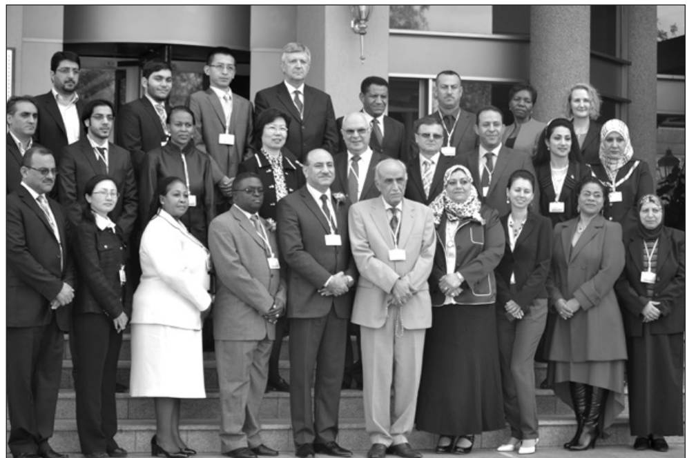
Members gather for the seventh meeting of the WGFACML, held June 17-19, 2013, in Windhoek, Namibia.