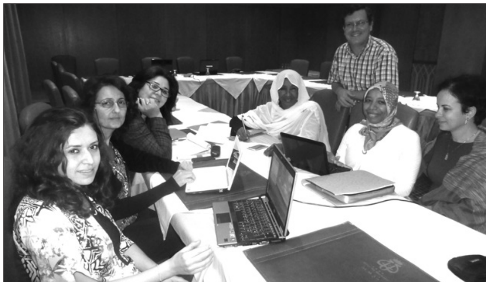
Resource Persons for the IDI-ARABOSAI Certification Program for Training Specialists