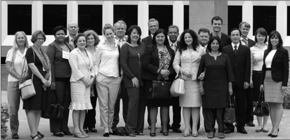
Members of the Compliance Audit Committee meet in Brazil, September 2013.