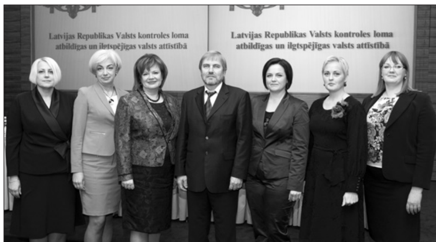
The Council of the State Audit Office of the Republic of Latvia gathers at a conference held November 4, 2013.

In response to recently initiated discussions on the role and mandate of the supreme audit institution of Latvia, the SAO organized an open conference in November 2013 where