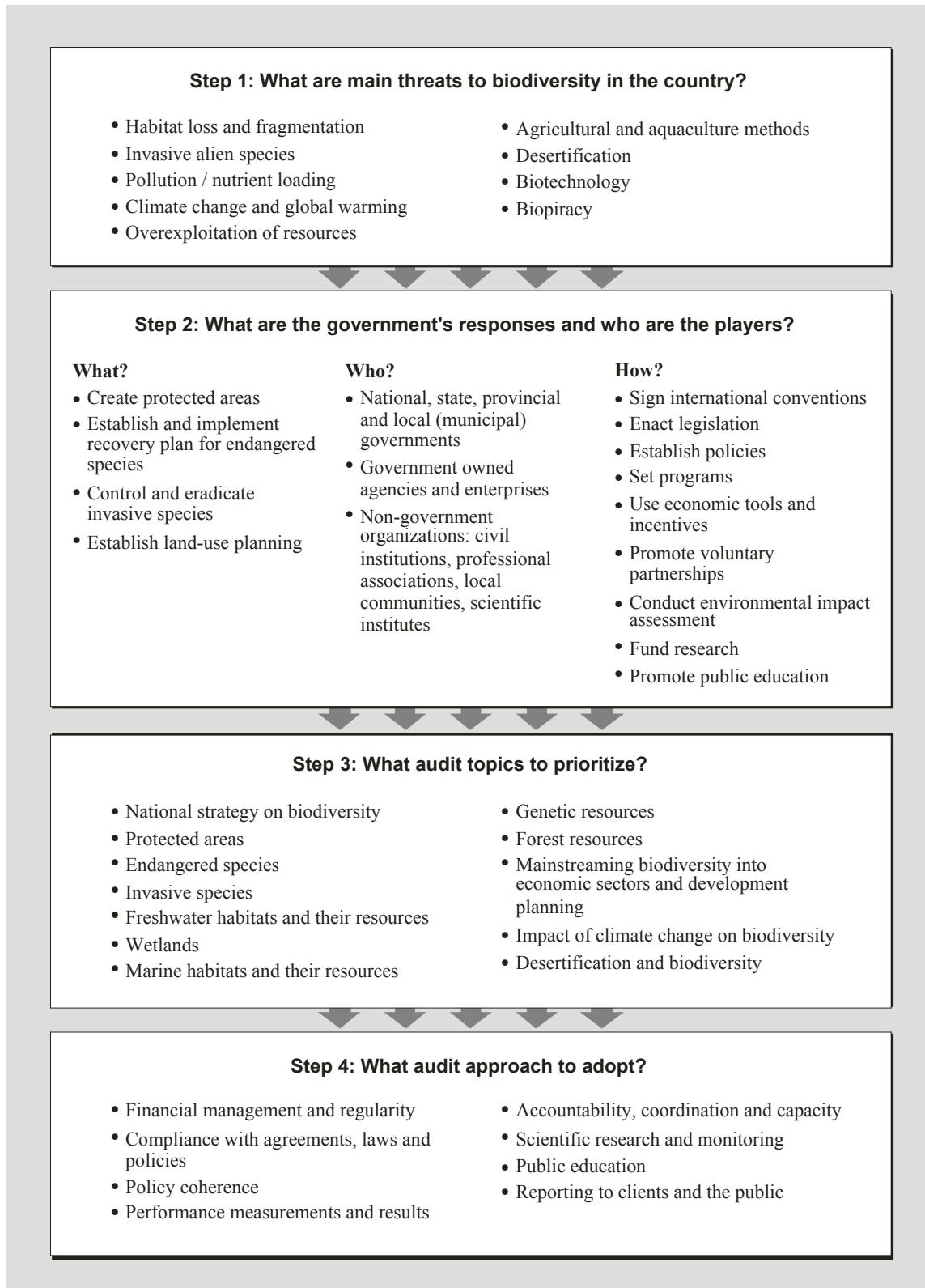
Exhibit 6: Four basic steps for choosing a topic and approach for an audit of biodiversity